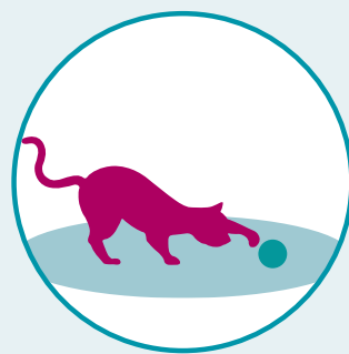
Chasing moving objects